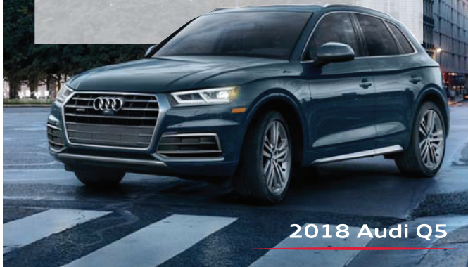
2018 Audi Q5

Redesigned and reimagined from the outside in, the Audi Q5 exudes style and refinement everywhere you look. From the flowing exterior Shoulder line to the luxurious amenities within, you'll see we're redefining how an SUV looks — and feels.