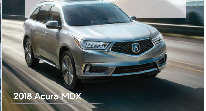
2018 Acura MDX

Every 2018 MDX lets you simplify life through advanced technology like Apple CarPlay™ 51 and our next-generation On Demand Multi-Use Display™ touchscreen. Stay connected and use Android Auto™ 52 to access your texts, emails and music